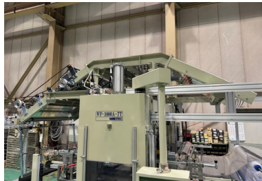
Camelback(For sheet reversal)